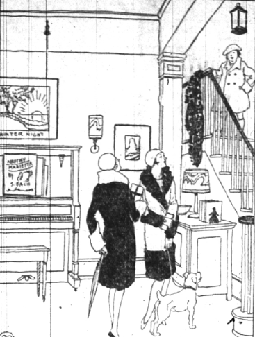
There are 11 mistakes in this picture. For solution to above turn to page five of this section.

Lake, Born in Ohio in 1890. Owner of Walled Lake Home Telephone Co.