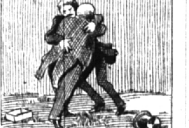
Voters and those of you who have not yet decided whether to be a candidate for something this year, the above photograph, snapped last night by an over-vigilant photographer at Oak street and O. K. terrace, is a scoop.