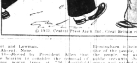
Illustration of a man and a woman talking, part of the McClure comic strip.