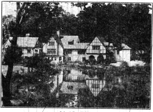
School For Children