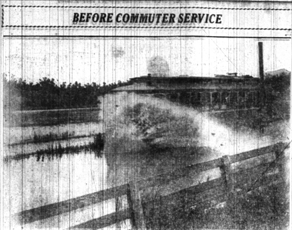
There is little danger that passengers on the new commuter service will ever be forced to get out and walk while the train plows through several feet of standing water, as was the case one time on the old 'lectric back in 1898. The temporary lake, which held up the service but did not disrupt the schedule entirely, was located on Woodward avenue about three

"I believe because of the added transportation facilities that we will have in the near future over the Grand Trunk between Detroit, Birmingham and Pontiac, that Birmingham will have a population of 30,000 within five years."