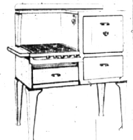
THE MARYAN Beautiful porcelain-enamelled exterior and interior. Equipped with Hot Water over-expressing control. Economical manifold control. Steam, hot water, built-in Pyrofax. Mordenal valves.

No cooking appliance can bring the country housewife so much comfort, pleasure, and leisure as one of these beautiful new ranges. No cooking fuel will give her the economy and efficiency Pyrofax brings. All dirt, ashes, and the inconveniences of liquid fuel are done away with. Come in or telephone for our wonderful new book, let "Cooking Made Easier."