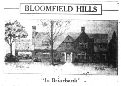
"In Briarbank" This attractive English home is now nearing completion on Barden Road, just south of Bloomfield Hills Country Club; contains six bedrooms, with four baths. Modern in every respect.