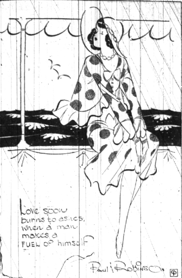
LOVE SCORNS burns to ashes, when a man makes a FUEL of himself

daughter, "the best child, a mother could have."