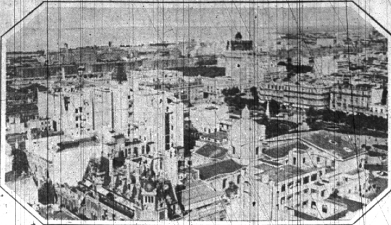
This unusual photo of the revolution-tormented city of Buenos Aires, capital of Argentina, shows in the foreground the dome of the Cathedral facing on the Plaza de Mayo. Where two alleged leaders of a post-revolution riot were publicly executed. As a result of the outbreak, President Hipolito Yrigoyen was ousted and General Jose A. Uriburu made provisional president.