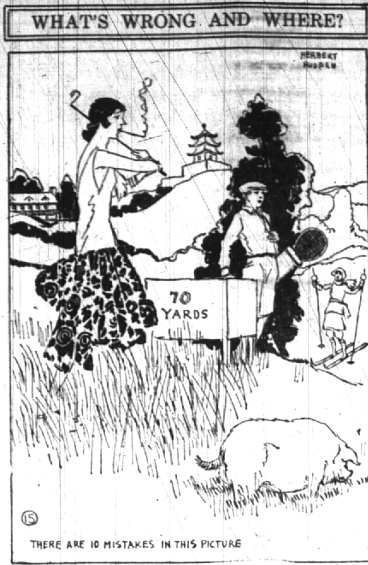
For solutions to above, see page five, this section.