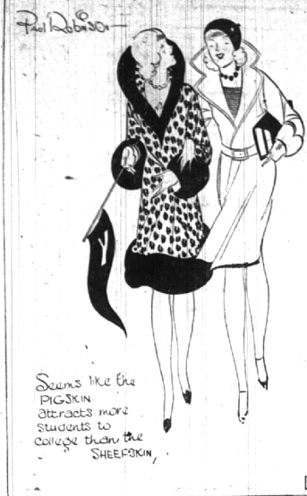
Sneak like the PIGSKIN attracts more students than the SHEEPSKIN