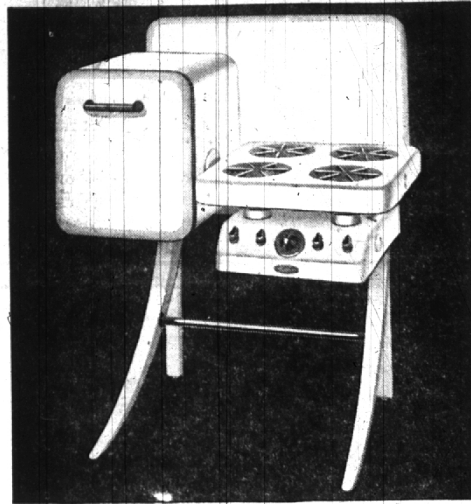
Cash Price $105 Installed $10 Down, $6 Per Month