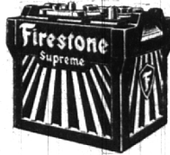
Firestone Supreme Battery. Power, Long Life, and Dependability.