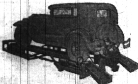
Firestone Electro Dynamic Brake Tester, to insure accurate brakes.