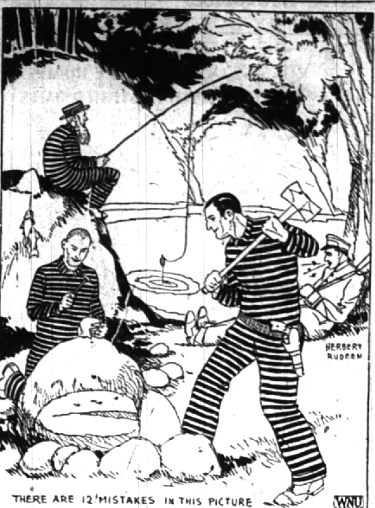
THERE ARE 12 MISTAKES IN THIS PICTURE

Bread 6c Coffee 35c YOUR DOLLAR BUYS MORE AT A KROGER STORE