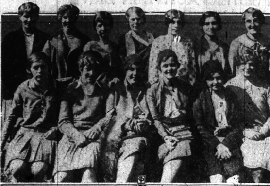
Thirteen Barnard college freshmen.