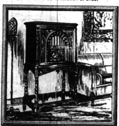
This is the Scott's World's Record Custom-Built Radio—just one of the twenty-two especially designed, custom-made, acoustically perfect receivers in which Scott's World's Record Custom-Built Radio is available. And to see and inspect these great works of art will be a revelation to you. The Abbey's 1440. Other models range upward from $125.

any other receiver available today in points of sensitivity, power, selectivity and tone! Come in—or phone for a demonstration at once.