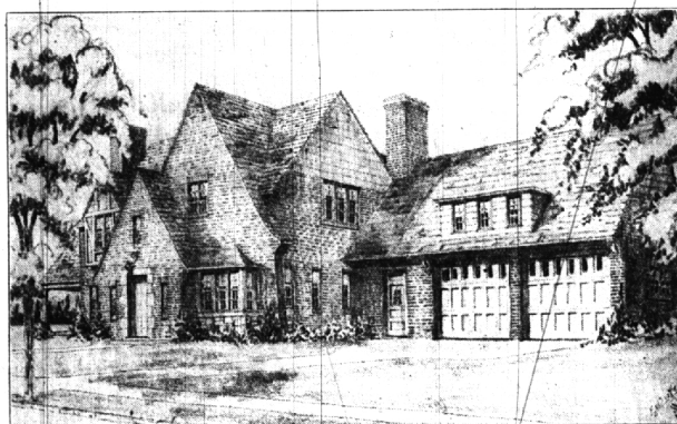
Being built for Van C. Worden

Mechanical Refrigeration Bennett Fireplace Heater Rolscreens Chromium Plate Fixtures Package Receiver Incinerator Radio Wired Automatic Heating Control Oil Burner Automatic Hot Water Heater Recessed Radiators Steel Medicine Cabinets