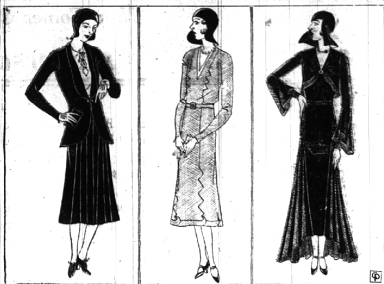
Left, navy tailored suit for street wear; center, suit for informal afternoon or general wear; right, costume for formal wear of sheer flat crepe or Georgette.