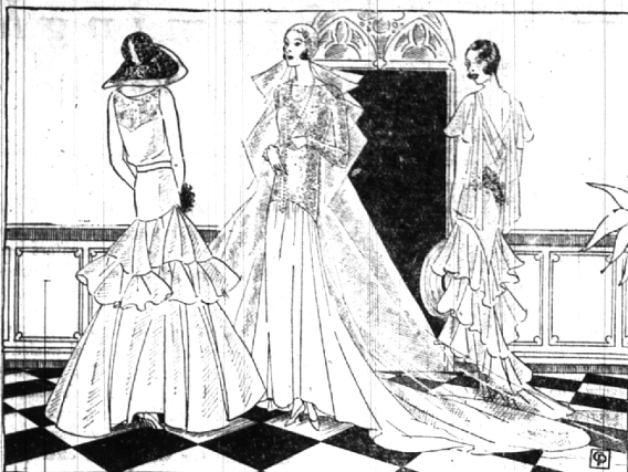
Bridal gown of satin and lace, center; left, bridesmaid's frock of white organdie; right, maid of honor's dress of pink chiffon.