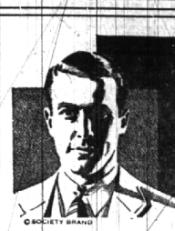
G. SOCIETY BRAND