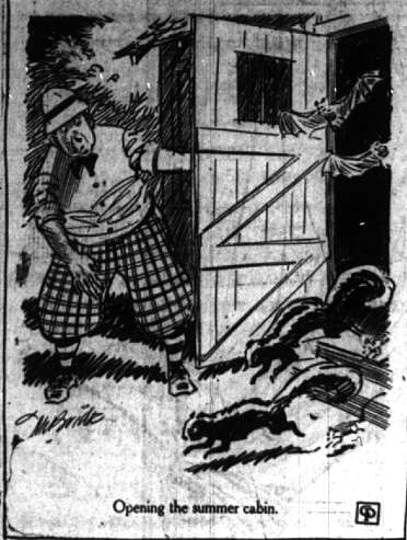
Opening the summer cabin.