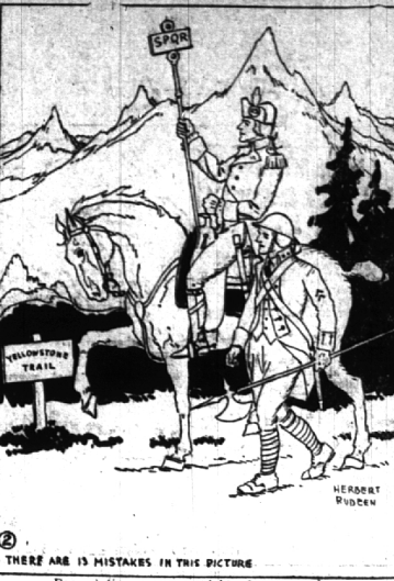
For solutions see page eight of this section.