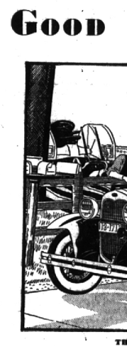
THE NEW FORD TUDOR SEDAN

YOU are buying proved performance when you buy a Ford. You know it has been built for many thousands of miles of satisfactory, economical service.