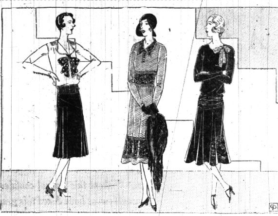
Left, tuck-in blouse; center, one-piece red flat crepe frock; right, brown crepe with shirred waistline.