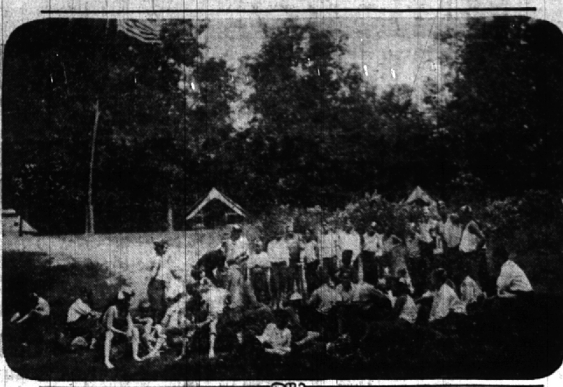
Looks as Though Something May Happen Here in this Y. M. C. A. Summer Camp Group

There is a boy in this little story, but his name isn't going to be mentioned. He is just one of the many boys in Oakland county who have benefited from the summer camp conducted by the four associated Y. M. C. A. groups in the county.