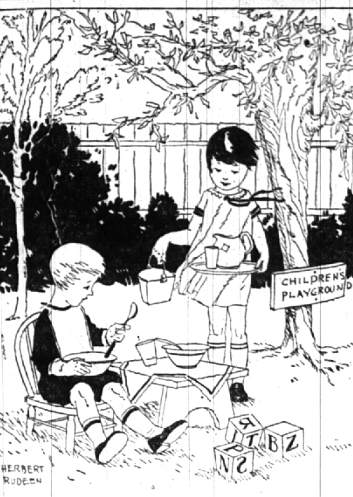
THERE ARE 10 MISTAKES IN THIS PICTURE.

How good are you at finding mistakes? The artist has intentionally made several obvious ones in drawing the above picture. Some of them are easily discovered, others may be hard. See how long it will take YOU to find them. For answers see page five of this section.