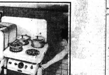
(Right)—OVEN CANNING is convenient and easy—Electrochef will simplify your canning problem.

The ELECTROCHEF electric range, selling at its present price, is an unusual value. All-white porcelain enamel finish, with metal parts of mirror-like Chromeplate, this stove is a high-quality product and is extremely well-built throughout. Focused radiant heat makes the ELECTROCHEF fast and economical in operation. The oven has double air-space insulation. Four reflectors on the cooking table focus all the heat directly on the utensils. Each heater has three intensities—high, medium, and low; oven control of heat assures any temperature to 600 degrees.