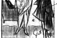
A mix of very few words is generally nice.

Avoid letting the wrists break until you are half way down to the ball, then throw your right hand at the hole.