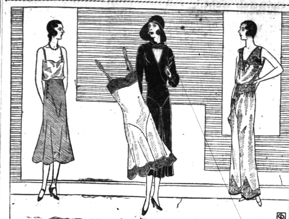
Left, silk crepe petticoat and step-in with fitted waist and hips; center, flat crepe frock in new rust tone; right, shell crepe lounging pajamas.

By LUCY CLAIRE Fashion Writer for Costume Press FITTED LINES for undies have come back to such an extent that we may expect to return to corset covers at any moment. The normal waistline has brought back the petticoat. Women have found that it's petticoat is really a necessity or the new frocks with their fitted waistlines and gathered round the waist, left to hang in a straight, full lines, affair flared like the skirt itself. A version of the new petticoats is shown at the left of the sketch. It is fitted at the waist and over the hips, and fastened with buttons or snappers at the side for smoothness. The step-in combination also has its fitted waistline with panties flaring just below the hips that there may be no unnecessary wrinkles under the fitted silhouette of the frocks they are wearing. Both petticoat and combination are of soft silk crepe, the combination trimmed with an off-white or ecru lace.