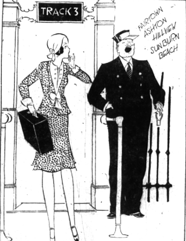
VACATION BOUND BY RAIL—a slight pause for station announcements!

Lady's Plain Silk Dress Miracleclean and Pressed