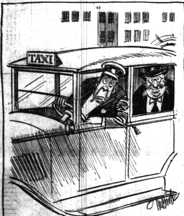
Taxi driver who absent-mindedly drove his "fare" direct to destination before he realized what he was doing.