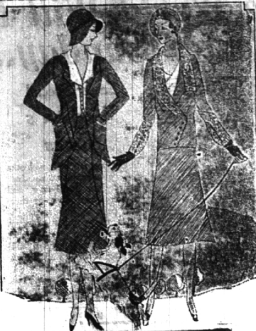
Left, tailored suit; right, dressy type.