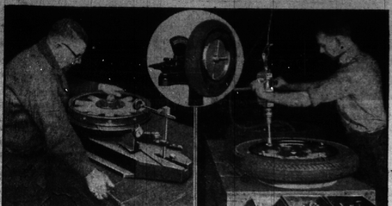
Left, testing wheels which have been balanced by addition of small metal weights. Inset, tire balancing machine which determines lightest section of casing where tube valve is to be used as counterweight. Right, assembling balanced tires on balanced wheels at Oakland-Pontiac factory.

Police Department, who reported a call broadcast to the scout car, while more than a mile away from the indicated trouble, was answered in less than three minutes.