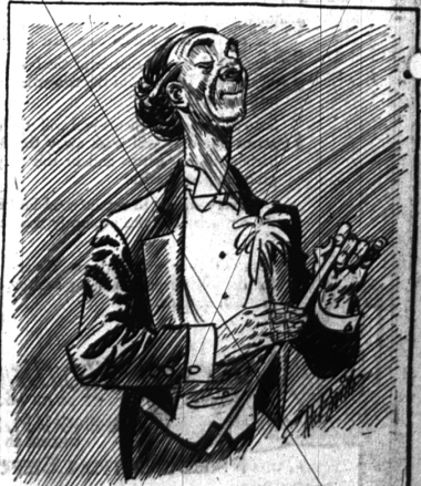
Egotistical leader who thinks everyone came to see him instead of to hear his orchestra.