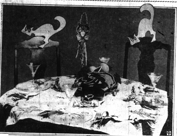
TABLE DECORATIONS FOR HALLOWE'EN