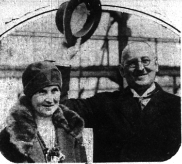
Returning a visit made to Berlin several months ago by Mayor Jimmy Walker of New York City, Gustave Boess, mayor of Berlin, is shown above with his wife, as he waved a cheery greeting upon arrival in New York. He is keenly interested in American municipal government.