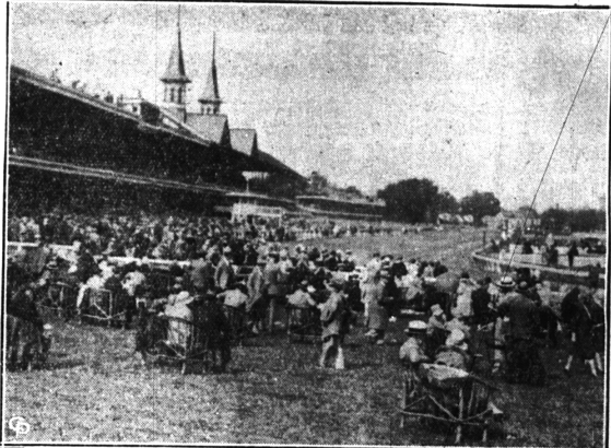
A view of the grandstand and some of the overflow crowd that jammed the track at Churchill Downs, Louisville, for the 55th running of the Kentucky Derby. This photo was snapped between heavy showers that converted the track into a sea of mud and water, and drove the spectators back under cover of the stables. The crowd was estimated at 80,000.