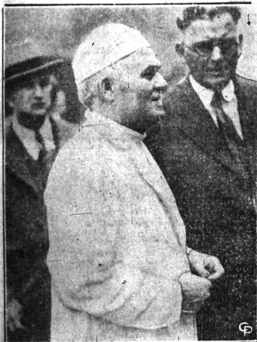
Dr. George W. Crile, one of the founders of the Cleveland Clinic hospital, Cleveland, and one of the nation's foremost surgeons, snapped near the hospital as he aided in rescue work following an acid explosion that snuffed out the lives of 120 patients and attendants and injured more than 100 others. The doctor was operating in another building of the clinic when the blast occurred.