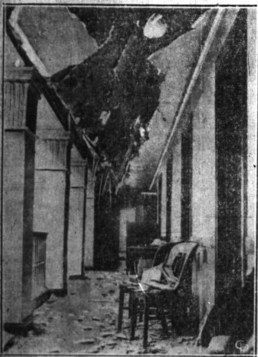
Scene from the interior of the Cleveland Clinic showing the wreckage caused by the acid explosion and fire that took an immense toll in dead and injured. Photo shows a hallway on one of the upper floors above the section where the blast occurred.