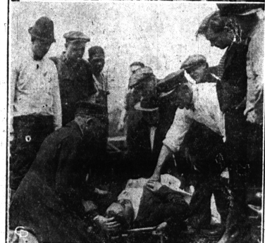
Arrow in top photo indicates the basement room in the Cleveland Clinic, Cleveland, where the acid explosion that took 120 lives and injured more than 100 others, occurred. Fire followed the blast and poisonous acid fumes accounted for the deaths of many of the patients and attendants trapped. Below is a rescue scene just outside the clinic.