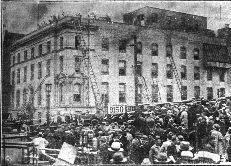
View of the Cleveland Clinic hospital, Cleveland, snapped at the height of the rescue work following an acid explosion and fire that took 120 lives and injured more than 100. Many of the injured were dragged to the roof of the building where doctors and nurses worked over them as the photo shows.