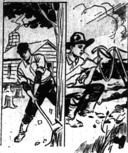
Judge Thomas Mellon, father of Andrew, was born on a farm in Lower Castleton, County Tyrone, Ireland. The family migrated to America in 1818. Near Pittsburgh they settled in a two-room log cabin.