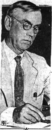
Sen. Reed Smoot

All the same, some congressmen believe that Senator Smoot has fired the first shot in what may develop into a vicious fight between sugar and tobacco interests—with the advantage distinctly in the former's favor, because sugar cannot very well be prohibited, but tobacco can be, if enough of that kind of prohibition sentiment should be stirred up—and there