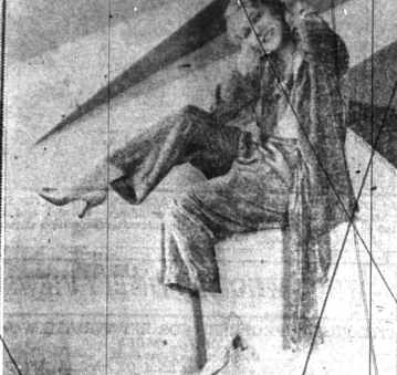
Leila Hyams wears this Rayon transparent velvet robe showing a printed pattern. The sleeveless jumper of silk matches the jacket lining and forms the collar. Comfort is in the belt trousers and sleeves, while a feminine note is added by the pearl tie. (Hierser)