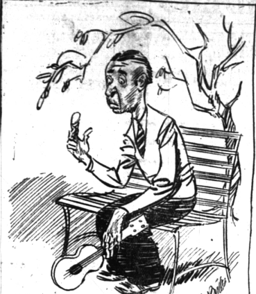
Sophomore who washed his "uke" finger on the eve of the inter-collegiate ukulele playing contest.