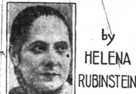
by HELENA RUBINSTEIN