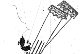
GLOVES for ladies have the new flair cuff, a fancy cuff, or the button style. In suede, $1.25 up . . . kid gloves, $2.50 up.