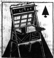
BLACK-BOARDS, very instructive and popular, for every child likes to draw. $1.98 up

The basement of The F. J. Mulholland Co. has taken on the appearance of a veritable Toyland. . . . Bring the kiddies in next time you're downtown. . . . Our displays of toys will delight them!