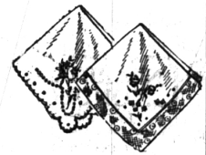
HANDKERCHIEFS in such variety that you can get exactly what you want—they are ideal inexpensive gifts. By the box, 3 for 25c, and up. Individually, 6c up.