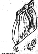
PURSES are always popular as gifts. See our display of leather purses in new styles . . . $2.25 up