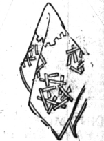
Ladies' scarfs in color and designs that will delight the most particular . . . lovely gifts such as these scarfs will have a cordial reception. $1.00 up