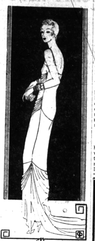
Choosing an evening gown, when one is to be a holiday hostess, requires thought and care. One must look stunning, yet the gown must have a quiet elegance. This Frances Clyde model in white fits the figure perfectly, showing the natural waistline curve, and giving the long-lined silhouette. The bodice is draped horizontally across the front. Two side trains are fashioned by splitting the flounce on the sides, and its ends swing down back to fashion the train.

Very individual is a gracefully modeled gown of white that fits the hostess' requirements admirably. It fits the occasion perfectly, showing the natural waistline curve and giving the long-lined silhouette that everyone favors.