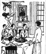
They Fell Upon the Greatest Dinner They Had Ever Seen.

There were twenty-five chairs on each side of the table and one placed at the head to be occupied by the young hostess.