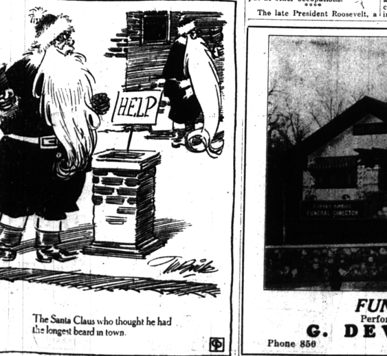
The Santa Claus who thought he had the longest beard in town.

The late President Roosevelt, a red-blooded fighter if there ever was one, praised the English system of handling conscientious objectors. In the British army, they were put on mine sweepers to clear the traffic lanes of the seas. This is a highly dangerous occupation, as the men on the sweeping trawlers, while they never have a chance to kill the enemy, run momentary risk of being blown to bits. Others were made stretcher bearers by the British government and ventured out, unarmed, on the battlefields under shell fire, to aid their wounded comrades. Some of those who had voiced conscientious objections to fighting turned out bravely in favor of saving their own skins, and these quickly asked to be transferred to the comparative safety of trench warfare. But the majority of the conscientious objectors served loyally and courageously as mine sweepers and stretcher bearers throughout the war. Generally speaking, the men who later and have most violently against conscientious objectors are at heart cowards themselves. The thought of cold steel of the enemy makes them quail, and they cannot conceive of anyone wanting to evade slaughter through any other motive than that of cowardice.—William Allen White in Emporia (Kans.) Gazette.