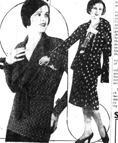
A scarlet crepe mart collar on a beige and scarlet woven blouse. The cuffs bell. The black velvet frock at the right, polka-dotted in green.

Collars that introduce a material not used in the frock elsewhere often use a bit of the goods of the frock to tie the two up. Such a style note is used on one of the new sweater blouses that uses scarlet flat crepe to emphasize scarlet and tan figured woven material. It has a ring of the woven material through which the soft scarlet collar slips, with its even hanging. The cuffs on this blouse are held in precisely the same manner as the blouse itself, with a square scarlet button and buttonhole fastening both the cuff bells, for there is one at the lower edge of the cuff and one at the top. Afternoon dresses are the ones