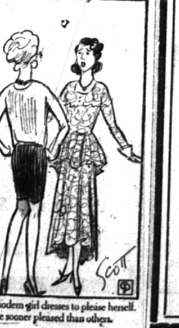
The modern girl dresses to please herself. Some are sooner pleased than others.