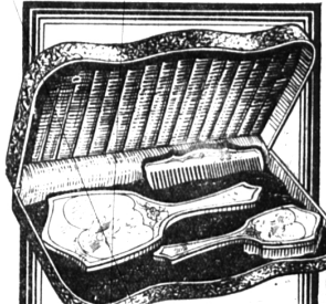
Toilet Set —Comb, mirror and brush of amber and pearl lines—with dainty wreath design—comes in attractive silk lined gift box—Sallan Value—$495