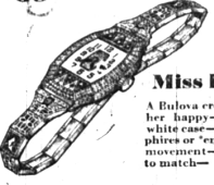
Miss Liberty —A Bulova creation, will make her happy—engraved super white case—with 6 "sapphires" or "emeralds"—12-jewel movement—metal bracelet to match—$3750