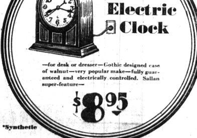
Electric Clock —for desk or dresser—Gothic designed case of walnut—very popular make—fully guaranteed and electrically controlled. Sallan super-feature—$895