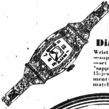
Diamond Set —Wrist watch—the gift of gifts—super white engraved case—set with 2 diamonds and 4 "sapphires" or "emeralds"—12-jewel dependable movement—metal bracelet to match—$2995