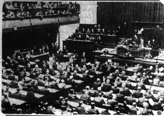
Photo shows a general view of the Salle des Nations at the opening of the ninth congress of the League of Nations at Geneva, Switzerland. Arrow points to H. Procope, new foreign minister of Finland, reading the opening address.