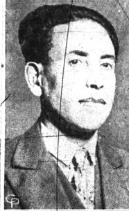
El Abdel Baghinel Ouafi, of Morocco, winner of the Olympic marathon, at Amsterdam, has arrived in the U. S. to compete in races here. Ouafi is said to be under contract with Tex Rickard for an American tour for which he is to receive $20,000.