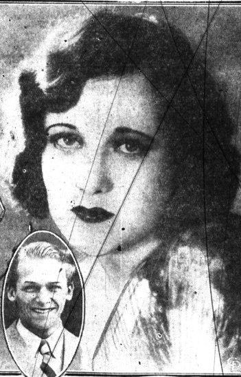
Joan Crawford, screen actress, and Douglas Fairbanks, Jr., son of the film star, and an actor, himself, have the folk in Hollywood, Cal., screen colony guessing whether or not they are married. The young couple admit they are engaged.