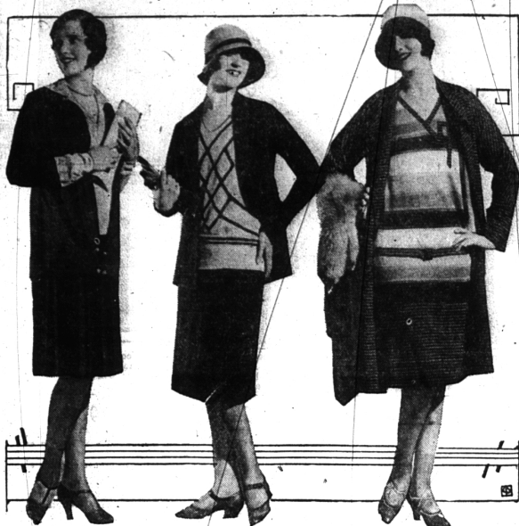
By LUCY CLAIRE

Fashion Expert for Central Press and The Eccentric