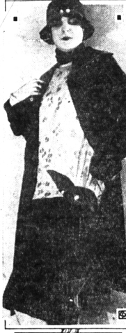
Col. Lindbergh's fame still inspires designers to add characteristic touches to garments and name them after him. This afternoon ensemble of Brazilian brown transparent velvet has the "eagle's wings" decoration applied on the blouse, which is of silk and metal threads woven in coin dot pattern.