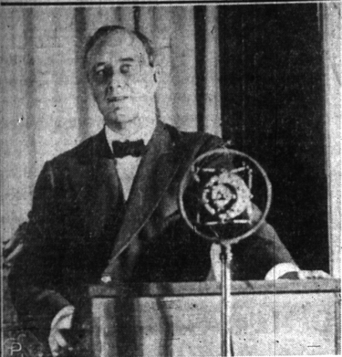
Franklin D. Roosevelt, the Democrats' choice as candidate for governor of New York, speaks at the microphone after being formally notified at the National Democratic club in New York of his selection as candidate.