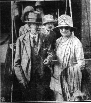
Improved in health, Sir Austen Chamberlain, British minister of foreign affairs, has arrived in the United States, with Lady Chamberlain, after a trip across the Atlantic and through the Panama canal. Photo shows Sir Austen and Lady Chamberlain on their arrival in New York. "I'm a self-made man, that's what I am—a self-made man," he said. "You knocked off work too soon," came a quiet voice from the corner.—Wall Street Journal.